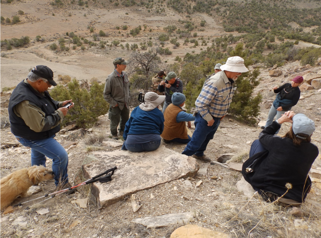
From a recent Chipeta trip to the Roatcap panel in 2021.